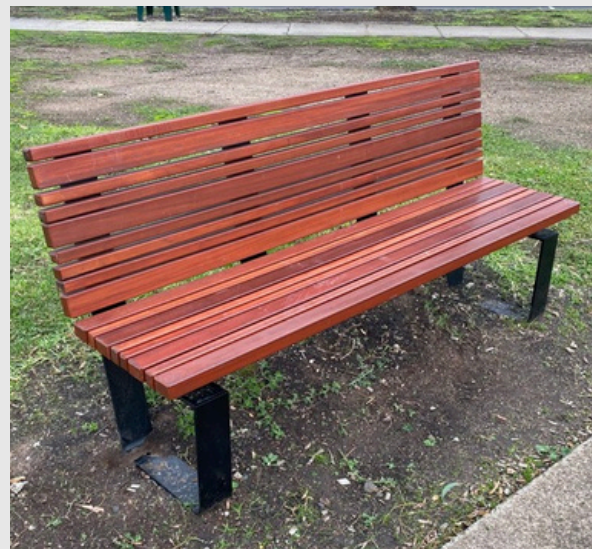
ST640 bench and ST630 seat also available.