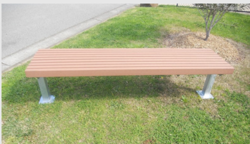
ST310 bench seat also available, with or without armrests.