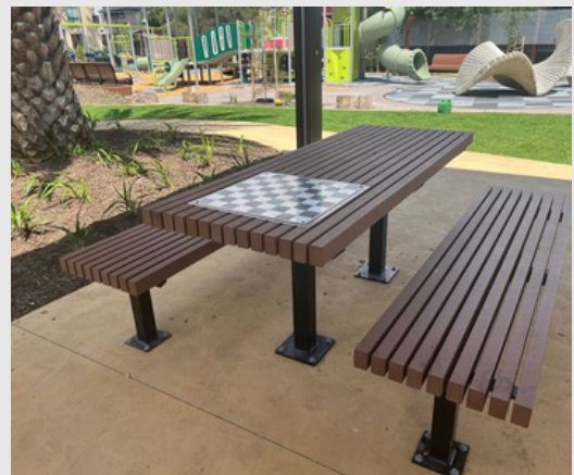
A stainless steel, etched chess board is also available as an option for the Kingsville picnic table.