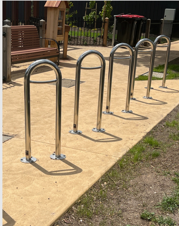
BR110 comes with crossbar