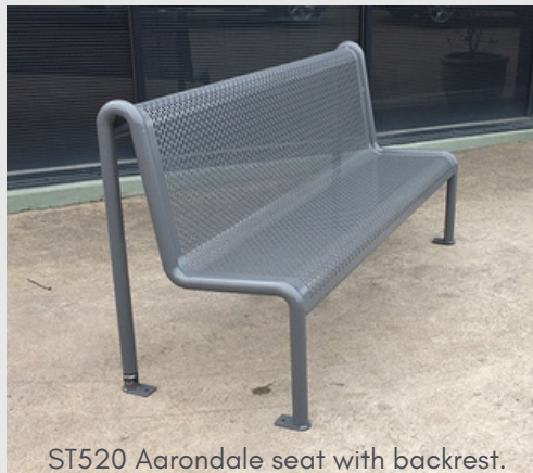
ST520 Aarondale seat with backrest.