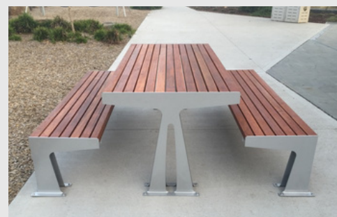
PS470 picnic setting also available