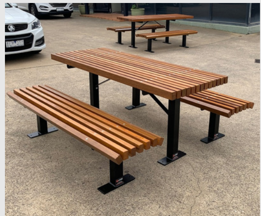
PS560 picnic setting also available