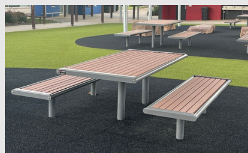
PS370 picnic setting also available

Did you know the Lindburn range is part of our Quick Delivery program?