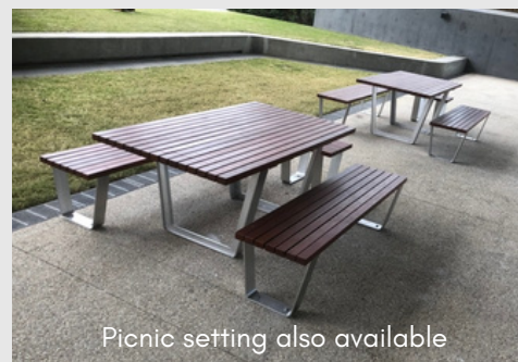
Picnic setting also available