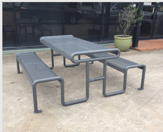
PS540 picnic setting also available